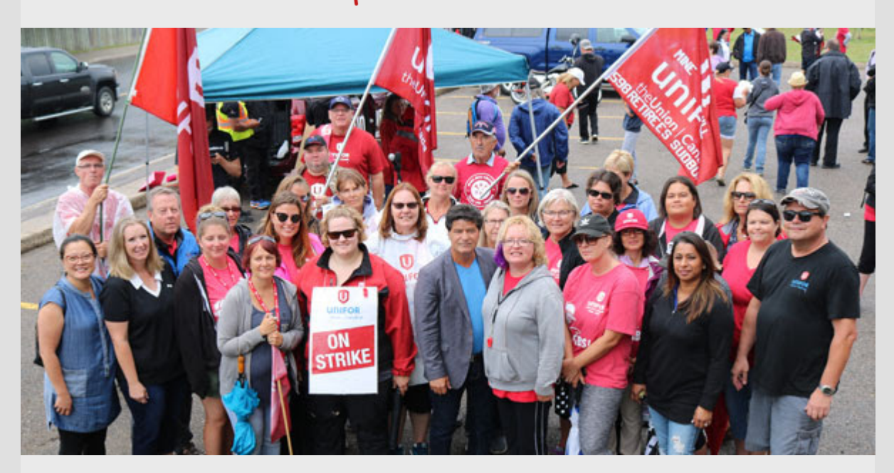
Striking workers and supporters shut the Port Arthur Health Centre after 121 days on a picket line in Thunder Bay.