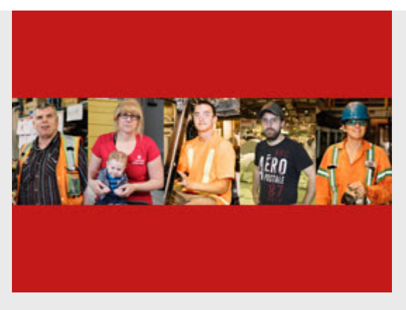
Despite lowering of assessed antidumping duties on Canadian paper mills, this approach to tariffs is deeply misguided.