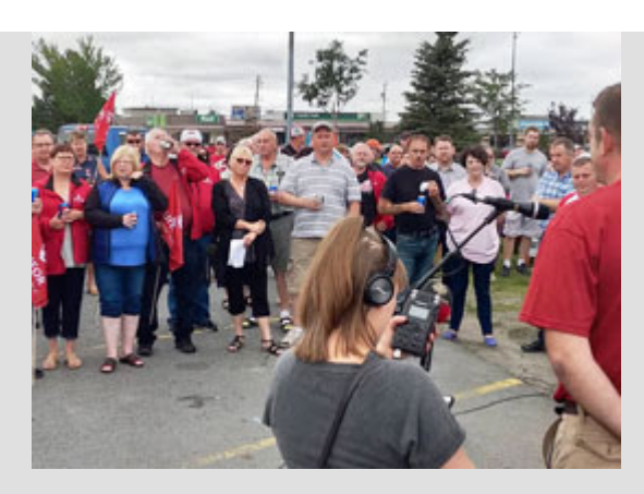
Demand Premier Dwight Ball modernize labour laws in light of the 597-day lock out in Gander by an American employer.